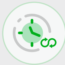
Long Cycle Life (6000 Cycles)