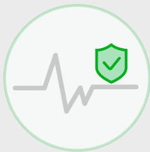
Safe to Use