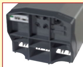
The PLATINUM S offers flexible connection options

The large back-lit full graphic display graphically represents all important operating conditions and performance parameters of the datalogger in clearly arranged graphs and diagrams. Week and year review functions allow a quick on-site performance control at any time.