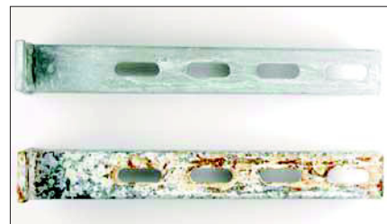
Cantilever Bracket 41/41 after 1,440 h salt spray test; Above: zinc-lamella coated Below: zinc-galvanised

The protection's performance equals or outperforms the one of hot-dipped galvanisation.