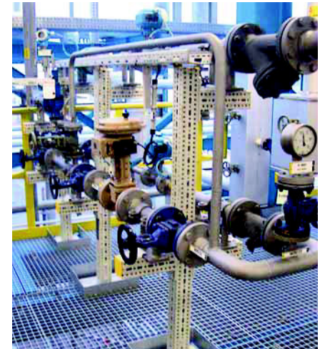
The Framo section is a product that offers customised-layer coating possibilities.